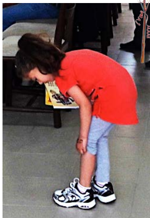
Checking out her new shoes!

For more than 15 years, BCI volunteers have “socked and shoed” thousands of kids in orphanages both in the spring and the fall. Because there are fewer children living in fewer orphanages, BCI did not have a shoe team this year. We still had some shoes and I purchased more in sizes where we were short. The boys from Borovtsi did an amazing job of fitting and shoeing!