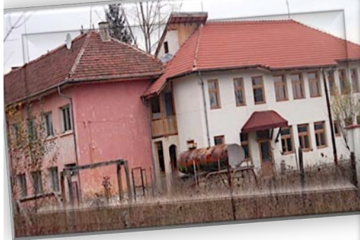
Time of Purchase